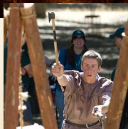
2010 Blackfoot Fort Mountain Man Rendezvous