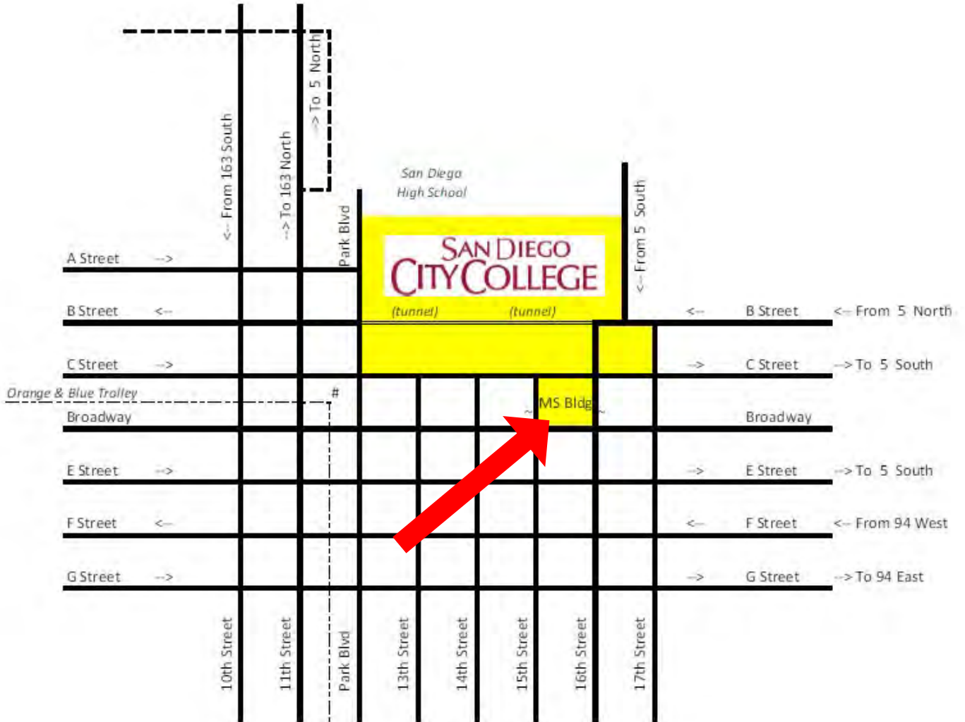
Close up of small yellow square labeled “MS Bldg”.